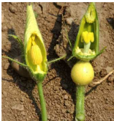
Cut Open Squash Blossoms: Male (left) and female (right) blossoms.

There are many ways to eat them: sliced in salads, stuffed, or deep-fried. Yes, the male flowers have nice long stems that are used like handles for dipping the blossoms into batter and then into deep fat. If you are planning to eat squash blossoms in salad or stuffed, make sure to remove the stems.