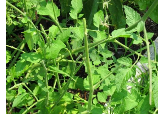
Short branches without leaves are a clue that caterpillars are on your tomatoes.