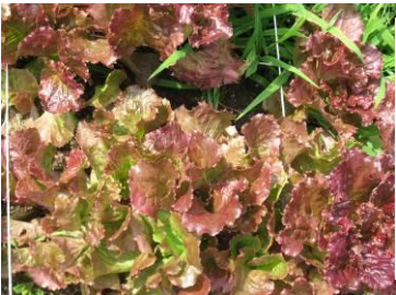
Red lettuce in the sun at the Clinton Community Garden

Arrange tomato slices in a wide bowl or pie plate. Sprinkle with basil slivers, salt, and pepper. Then sprinkle with olive oil. Cover with plastic wrap or foil and let sit at room temperature for about 15 minutes to let the flavors blend. Serves 2 to 3.