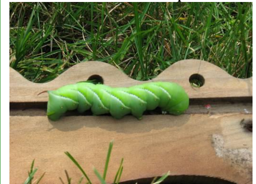
The caterpillars that Kate found were as long as and wider than her fingers.

When Kate was visiting gardens last week, she came upon tomato plants that had some branches without leaves. This means that tomato hornworm caterpillars were on the loose. These caterpillars are the same color as the tomato stems and stay very still when they figure out that you are looking for them. Be patient and methodical and you will find them. Put on your gloves and remove them from the plant.