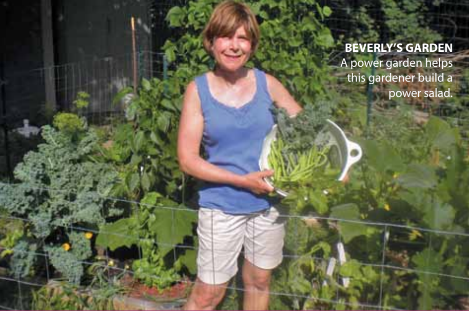
BEVERLY'S GARDEN A power garden helps this gardener build a power salad.