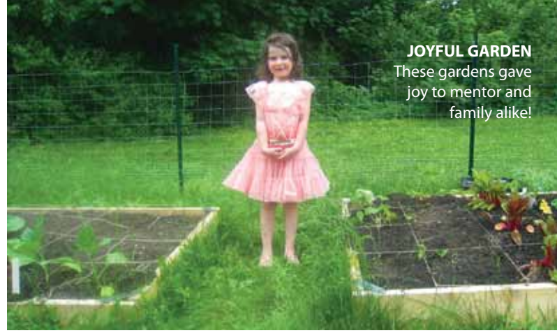
JOYFUL GARDEN These gardens gave joy to mentor and family alike!