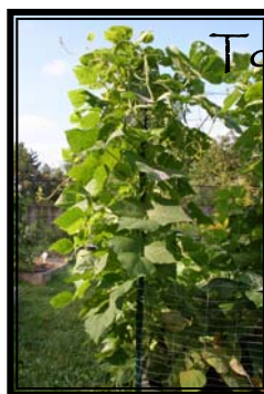
Towering bean plants

A hard working group of seniors in Sterling has created an abundant "Garden of Latin"!